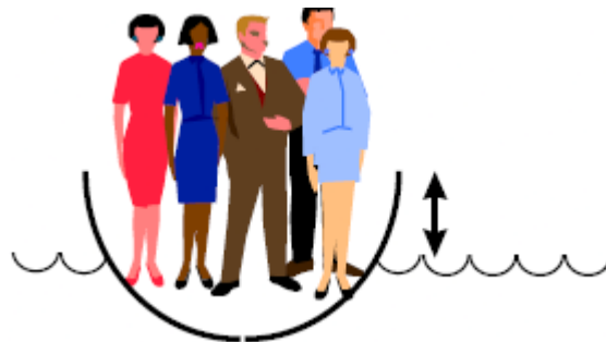
FIGURE 2. The technical contradiction in the lifeboat. As you add more people (weight) you get less freeboard (the distance from the gunwale of the boat to the water, shown by the arrow) This contradiction leads us to principles 15, 8, 29, and 34, all of which can be used to develop very plausible solutions using the available resources in the short time that the Titanic’s crew and passengers had available.

This is a reduction in length of a moving object, in terms of the contradiction matrix.