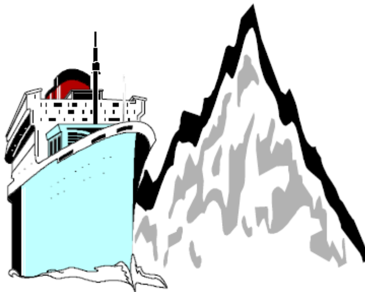
FIGURE 1. The initial conditions of the problem.

Published in the Proceedings of the 2 nd Altshuller Institute Conference, May, 2000.